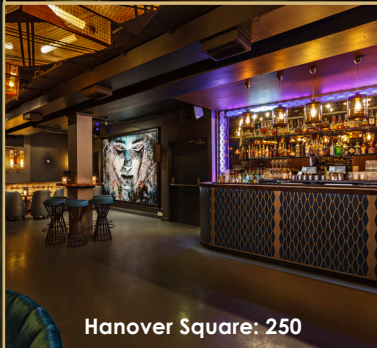
Hanover Square: 250