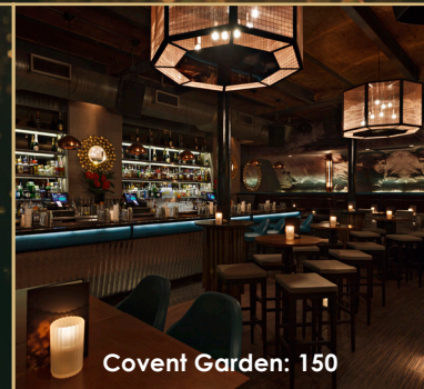
Covent Garden: 150