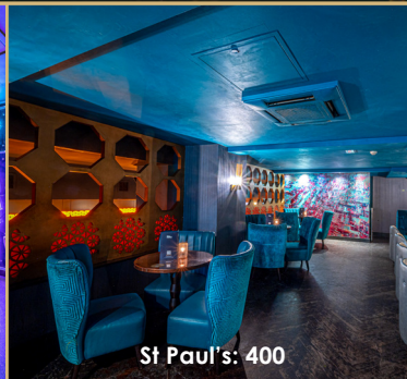
St Paul's: 400